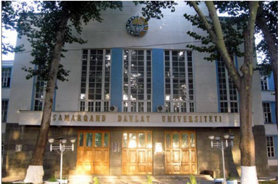
Samarkand State University