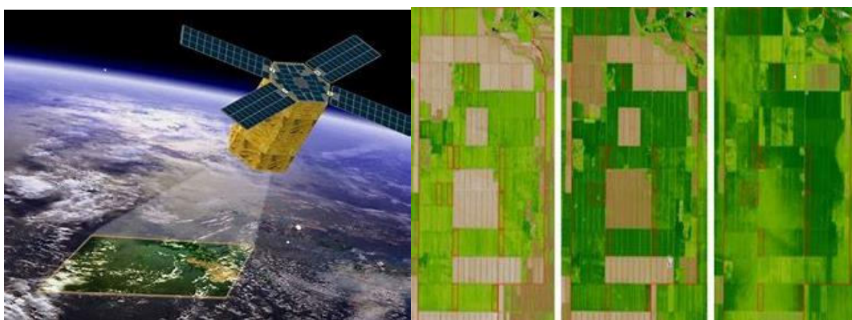
2 picture. Combined Landsat-TM and SAR data to determine (a) crop type and (b) damaged crop.

Multi-sensor data is more useful than a single sensor as it increases the classification accuracy with the large amount of information it contains ( picture 2).