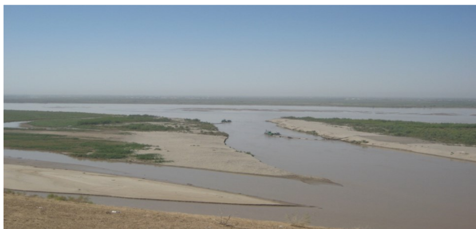
Figure 1. The first and second artificial streams that receive water from the Amu Darya.