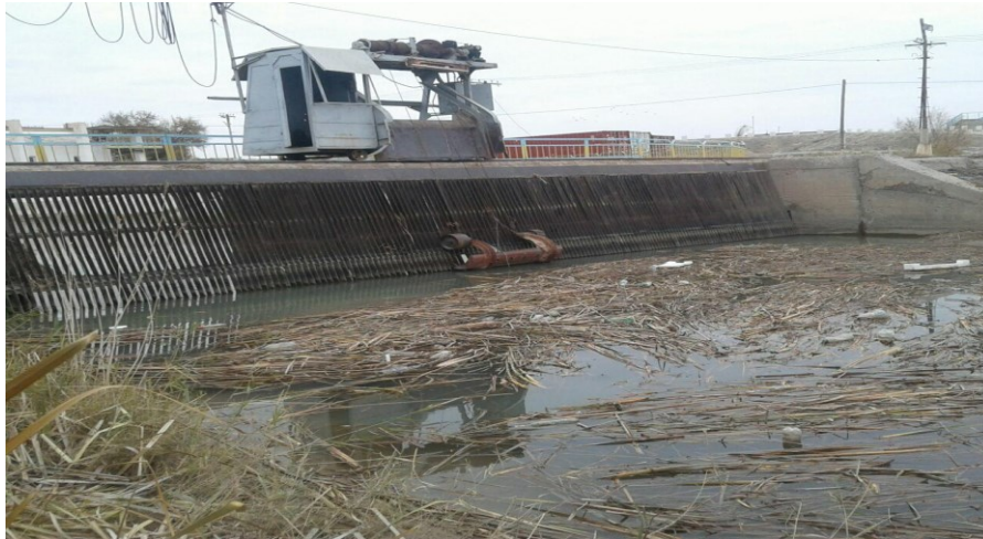
Figure 2. The process of cleaning up wastes that has accumulated in front of a structure.

of a canal with very high turbidity and stagnation of turbid water in the canal are in turn the main causes of turbid subsidence. Solving the problem through modern technologies and innovative proposals is a requirement of today.